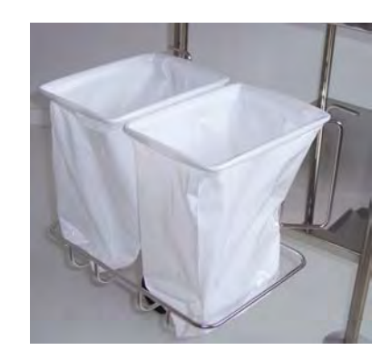
Twin bags holder 10 L Ref.220