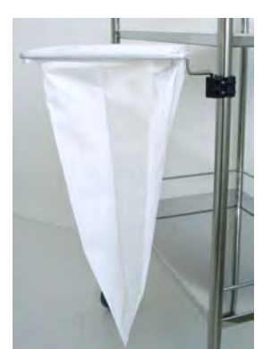
Swivel plastic bag holder Ref.114