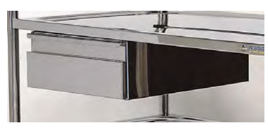
■ Stainless steel drawers for shaped trays Easy to set on 600x400 or 750 500 trolleys Two small models can be set side by side.