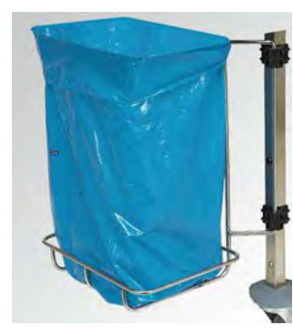
Swivel plastic bag holder 30 L Ref. 120