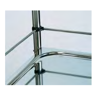
Guard rail and clip ref. P27 (See page 3)