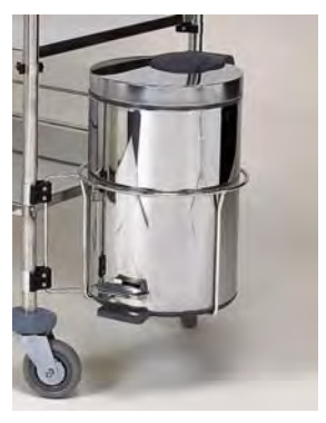
Holder and stainless steel waste bin Réf.110